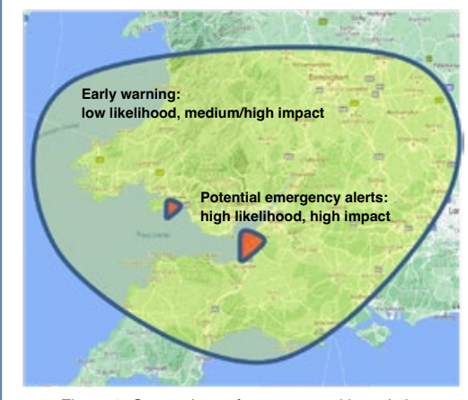
Figure 3: Comparison of area covered by existing warning (yellow) and proposed emergency alerts (red).

warning message will be action-oriented and research is in progress with a wide range of stakeholders to identify risk-reducing actions. Given time pressure and since the primary uncertainty is in the rainfall, the warning will be initiated by the weather agency. However additional information may be required from flood and public safety agencies and it may be they who ultimately issue the warning.